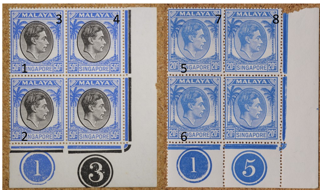
Figure 1. Blocks showing relatively well-aligned (left) and misaligned (right) perforations. Each numbered row of horizontal and vertical perforations was separately analysed.

Irregularity was quantified both inline – along the direction of a given row of perforations – and perpendicular to the row. Measurements were taken with reference to a straight line fitted to the centres of the holes using least squares.